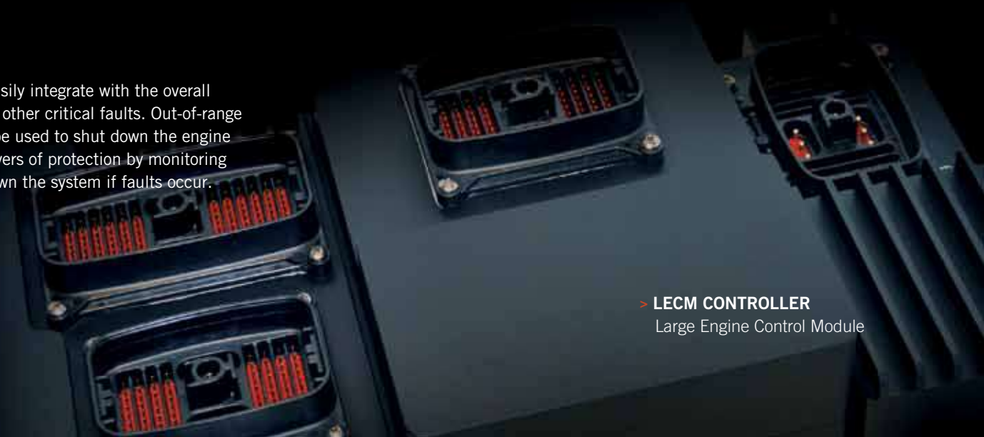
> LECM CONTROLLER Large Engine Control Module

Power Generation Gas Compression Alternative Fuel Vehicles Locomotives Marine Propulsion and Auxiliary Power Mobile and Industrial Equipment